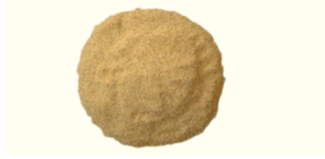
Lemon Peels Teabag Cut

Available Qualities: Coarse Cut, Square Cut, Fine Cut (Tea Bag Cut), Powder, Whole