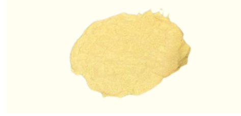
Lemon Peels Powder

Available Qualities: Coarse Cut, Square Cut, Fine Cut (Tea Bag Cut), Powder, Whole