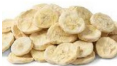
Banana Slices(10 mm) Powder