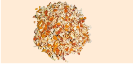
Orange Peels Coarse Cut

Recommended use: Bakery, brewery, beverages, snacks, dressings, dairy formulas, culinary creations