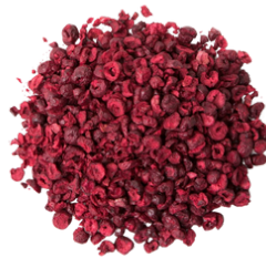
Sour Cherry Slices