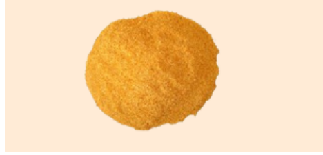
Orange Peels Teabag Cut

Available Qualities: Coarse Cut, Square Cut, Fine Cut (Tea Bag Cut), Powder, Whole