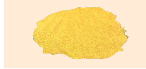
Orange Peels Powder

Available Qualities: Coarse Cut, Square Cut, Fine Cut (Tea Bag Cut), Powder, Whole