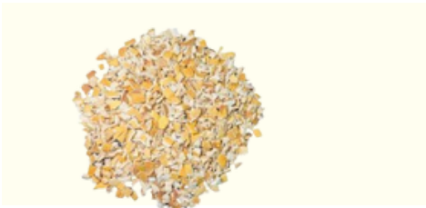
Lemon Peels Coarse Cut

Available Qualities: Coarse Cut, Square Cut, Fine Cut (Tea Bag Cut), Powder, Whole